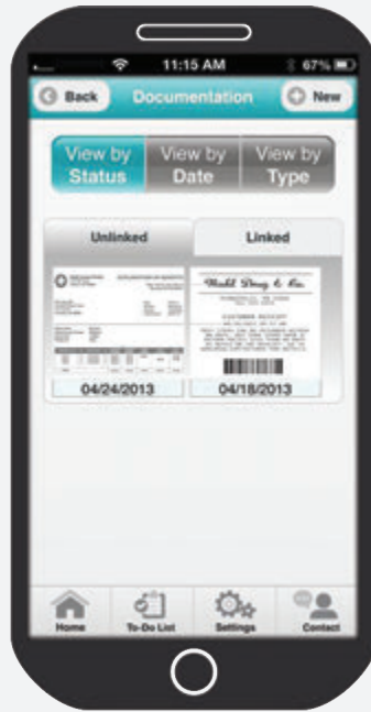
DOCUMENTATION HOME SCREEN